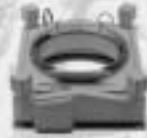
T-AD Gyro-stabilized Suspension Mount for ZEISS TOP