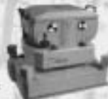
T-AD Gyro-stabilized Suspension Mount for ZEISS TOP