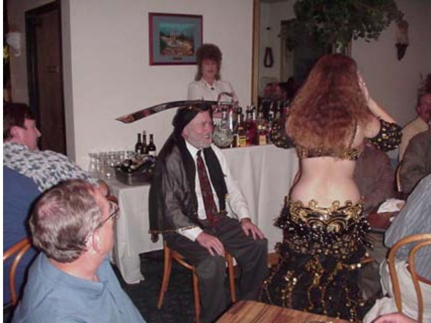
Seen at a Chapter meeting in his much younger years, this distinguished well known Surveyor just turned 60 years old! Happppppppppy Birthday!!!!!!!