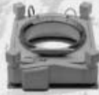
T-AS Gyro-stabilized Suspension Mount for RMK TOP

TWIN ENGINE PIPER, GERONIMO ZEISS TOP 15/23 CAMERA W/FMC GYRO STABILIZED MOUNT