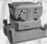
RMK TOP - Aerial Survey Camera System

AERIAL PHOTOGRAPHY PANORAMIC OBLIQUE PHOTO LAB AIRBORNE GPS AIRBORNE LIDAR DATA ZEISS PRECISION SCANNER