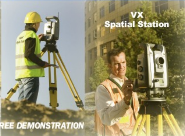
VX Spatial Station