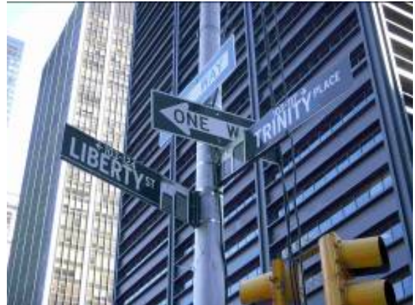
Street signs at southeast corner of WTC site

from the southeast block corner looking out to the northwest