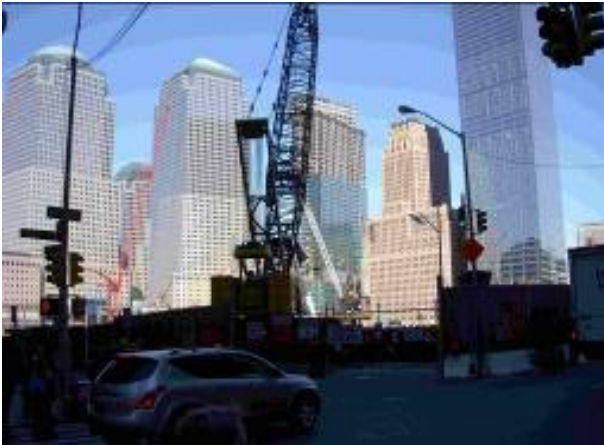
View of construction of the world trade center site

I just arrived back in town from my vacation to NY City. Attached are a few pics of a monument near the southeast corner of the block where the World Trade Center stood.