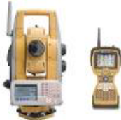
Robotic Total Stations