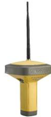
GR-3 GPS systems